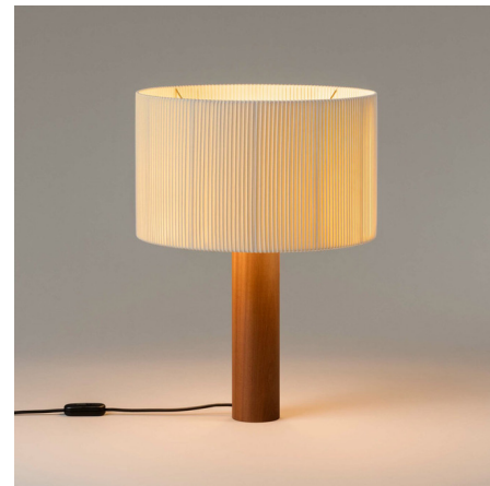
Shown in sapele wood / white ribbon

At the age of forty-four, Antoni de Moragas Gallissa designed the Moragas Table Lamp for his own office. Moragas had this lamp on his desk and would often use it to place notes and business cards he received, inserting them between the ribbon folds. A sturdy wood cylinder supports a head with three bulbs arranged radially and outwards, surrounded by a generous circular shade made from cotton ribbon (typically used for bookbinding) and has a thread running along the edge, forming an asymmetry that creates a splendid contrast of light and shadow.