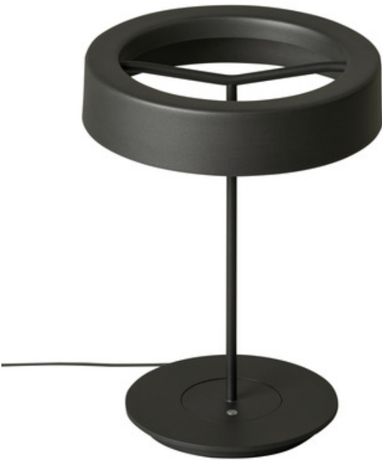
Shown in: Graphite / Graphite

Named for the Spanish word for without, the Sin Table Lamp is free of excess adornment and can even be used sans shade. Its design which combines a simple structure with LED technology offers a seemingly floating ring of light. The shade is easy to attach or remove, letting you effortlessly change the lamp appearance and lighting effect. The lamp is available with an aluminum shade that matches the lamp body, a white opal methacrylate shade, or without a shade.