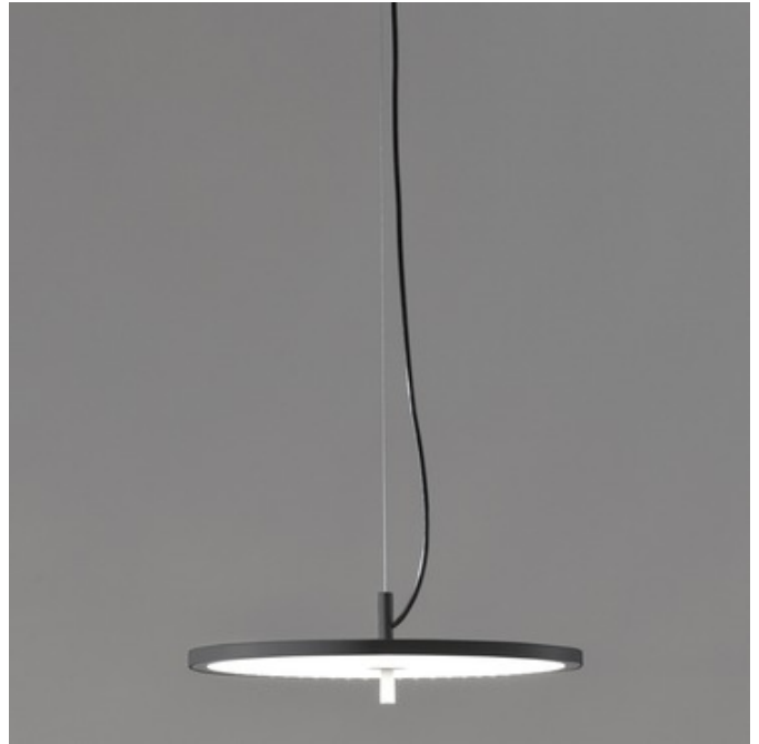
Shown in: Graphite

BlancoWhite Counterweight Pendant, designed by Antoni Arola, is a unique piece featuring a flat panel LED. Available with a Graphite finish in two sizes. CE UL and cUL listed.