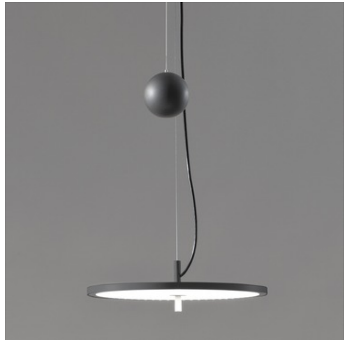
Shown in: Graphite

BlancoWhite Counterweight Pendant, designed by Antoni Arola, is a unique piece featuring a flat panel LED and a round counterweight. Available with a Graphite finish in two sizes. CE UL and cUL listed.