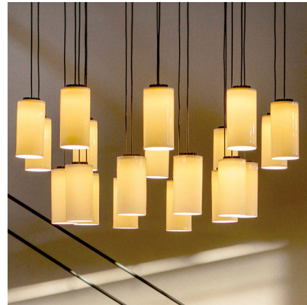
Shown in black / white porcelain

The Cirio Chandelier casts warm, radiant illumination that emanates throughout your space. Its abundant lights are suspended from a black aluminum frame of concentric rings, creating a dramatic, captivating focal point. Varying shade options are available to achieve the aesthetic that fits your application -- porcelain of Sargadelos (Galicia, Spain) which evokes the inviting glow of candles, translucent white opal glass for subtle purity, or opaque brass for elegant appeal. The cables that support the frame can be attached to the canopy or directly to the ceiling. Note: The 51.2 inch and 63 inch chandeliers require a junction box rated for fixtures weighing over 50 pounds.