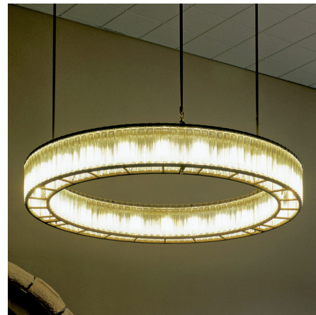
Shown in black / clear

The Estadio Pendant is a modern conception of medieval chandeliers. Consists of a Black metal structure and a stainless steel structure hanging system with three supports. Available in three sizes. Fixture must be mounted independently of a junction box, adapter included. NOTE: Due to the weight of the fixture, customers should confirm ceiling structure can support pendant. UL and CUL listed.