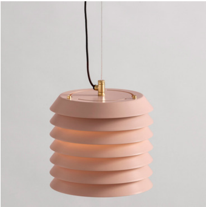
Shown in: Brass / Rose

Designed by Ilmari Tapiovaara in 1955 who once said that it is impossible to create a new object without a point of reference and nature is the best and closest manual for the industrial designer. The Maija collection conveys the feeling of light in Baltic cities, where the streets are barely illuminated, apart from the light beaming through the windows of homes and shops - from the inside, outwards. The honeycomb structure is composed of stacked metal discs that filter out its happy inner light.