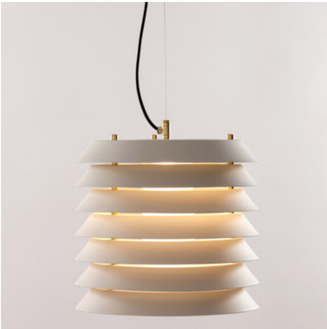
Shown in: Brass / White

Designed by Ilmari Tapiovaara in 1955 who once said that it is impossible to create a new object without a point of reference and nature is the best and closest manual for the industrial designer. The Maija collection conveys the feeling of light in Baltic cities, where the streets are barely illuminated, apart from the light beaming through the windows of homes and shops - from the inside, outwards. The honeycomb structure is composed of stacked metal discs that filter out its happy inner light.