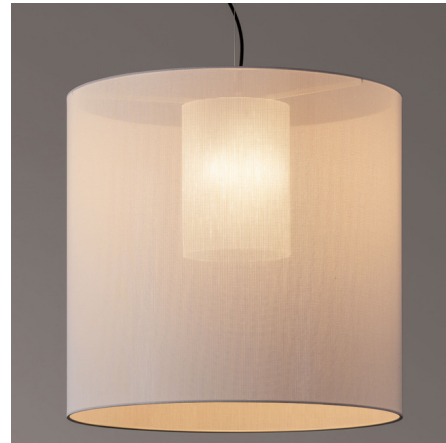
Shown in black / white

The Moare Pendant takes its name from the iridescent effect, moire, that is present when pairing a single cylindrical shade around an inner cylindrical methacrylate diffuser. Moare's clean-lined, cylindrical design will complement a variety of decor styles.