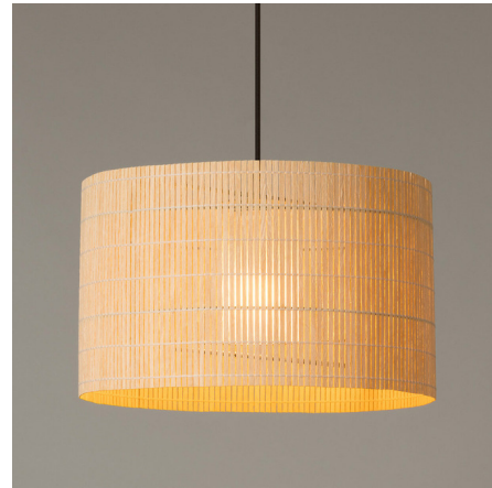
Shown in wood

The Nagoya Pendant is made of thin vertical strips of poplar wood attached to a circular structure. In 1961, the lamp was the first winner of the Golden Delta ADI-FAD award for the best industrial design produced in Spain at the time, and it remains an elegant and unfussy solution when hardwired fixtures are not possible.