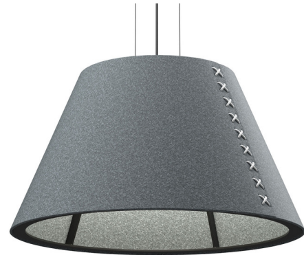
Shown in black / stone grey

Designed by Stal Collectief, the BuzziShade Pendant showcases modern design equipped with acoustic performance. Featuring a shade covered in noise dampening Buzzifelt fabric, this versatile fixture is able to reduce external noise levels to a minimum and prevent eavesdroppers from intruding upon conversations, making it a perfect option for offices, restaurants, or any large scale space. Creativity is at the forefront of the BuzziShade design, and it can be customized to suit your design desires with options for shade color, lace stitching, and frame finish. Shade colors: Stone Grey, Pink, Red, Mokka, Off White, Orange, Jeans, Light Blue, Lime, Curry, Eco Brown, and Anthracite. Lace stitching: Black, White, or Fluorescent Orange. Frame finishes: Aluminum, Black, White, or Fluorescent Orange.