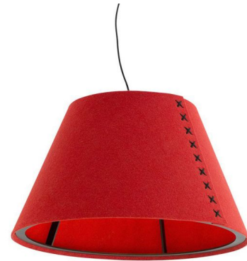
Shown in black / red felt

PRODUCT DIMENSIONS . . . . . Cord Length: 78"