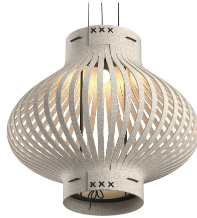
Shown in black / off white

The BuzziLight Mono Pendant combines illumination with acoustic performance. Featuring a lantern shaped shade composed of strips of BuzziFelt material, this noise dampening pendant allows for artful shadow play while still reducing sound, making it the perfect statement piece for any space. Available shade colors include: Stone Grey, Pink, Red, Mokka, Off White, Orange, Jeans, Light Blue, Lime, Curry, Eco Brown, or Anthracite. Available with White or Black lace stitching. Canopy finished in coated Black metal.