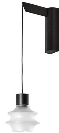
Shown in ebony black / frosted glass

COLOR RENDERING . . . . . 90 CRI LAMP COLOR . . . . . 2700K LUMENS/WATT . . . . . 115.00 LUMINOUS FLUX . . . . . 345 lumens