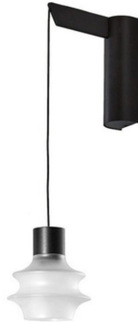
Shown in: Ebony Black / Frosted Glass

The Drip/Drop A/01 Hanging Wall Sconce features a compact LED light with charming shade, suspended like a lantern for a unique aesthetic. The shade, made of fine borosilicate glass or polycarbonate, casts a bright yet intimate light. An on/off switch is conveniently located on the base. Notes: A backplate for mounting on a 4 x 4 inch junction box is included. It is shown in the line drawing but not in the photos. The Drop shade shape is not available in Opal Polycarbonate.