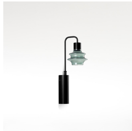
Shown in ebony black / green glass

The Drip/Drop A/02 Wall Sconce pairs a slim stem with a charming shade made of fine borosilicate glass or polycarbonate. It casts a bright yet cozy light, perfect for living rooms or bedrooms. An on/off switch is conveniently located on the base. Notes: A backplate for mounting on a 4 x 4 inch junction box is included. It is shown in the line drawing but not in the photos. The Drop shade shape is not available in Opal Polycarbonate.