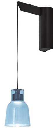
Shown in ebony black / blue glass