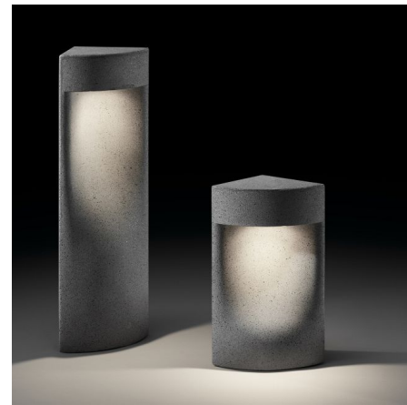
Shown in gray

COLOR RENDERING 90 CRI LAMP COLOR 2700K LUMENS/WATT 130.77 LUMINOUS FLUX 850 lumens