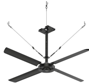
Shown in matte black

Eco 460V 3Phase Ceiling Fan is a large industrial fan pushes air into every nook and cranny of your facility with blades designed by aerospace engineers. Offer full range of control including our standard 1:1 analog control and our networkable touchscreen controls with the flexibility to manage up to 30 fans. Plug-and-play technology and lightweight components make the ECO quick and easy to install. Features a 220V 3Phase Black anodized aluminum motor and 12, 14, 16, 18, 20, and 24 foot blade diameters. These fans have 50 percent more efficient horsepower, 22 percent easier installation, 32 percent less weight, and 50 percent fewer parts than the average competition. Includes Fan I-beam mount with pre-wired adjustable 2.5-4 foot downrod, control panel, wall control, mounting hardware kit, communication kit, and guy wire kit. Additional downrod lengths are available and sold separately.