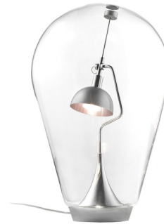
Shown in chrome / crystal

COLOR RENDERING . . . . . 90 CRI LAMP COLOR . . . . . 2700K LUMENS/WATT . . . . . 111.11 LUMINOUS FLUX . . . . . 500 lumens