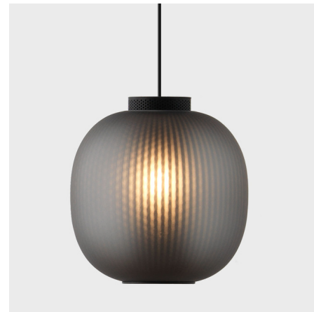
Shown in black / textured black

COLOR RENDERING . . . . . 80 CRI LAMP COLOR . . . . . 2700K LUMENS/WATT . . . . . 78.33 LUMINOUS FLUX . . . . . 470 lumens