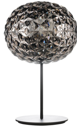
Shown in smoke crystal