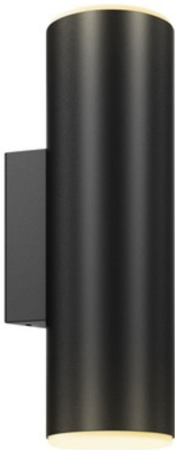
Shown in: Black

LED Wall A Cylinder Outdoor Wall Light features a cylindrical housing made of extruded aluminum and a die-cast aluminum canopy. Includes 3 optical options: a bright aluminum reflector that provides a 45 degree beam spread, a frosted glass lens to allow a wider beam spread, and a die-cast aluminum cap to allow a down light only version. All components undergo a rigorous pre-treatment and are coated with a baked powder paint coat, giving them a highly durable finish. Available in White, Satin Grey, or Black.