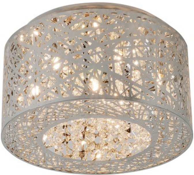
Shown in: Polished Chrome

The Inca Ceiling Flush Mount is artistically unique in design with a steel web shade and interior crystals which provide a festive sparkle. Two sizes and two lamping options. Available in Bronze with Amber crystals or Polished Chrome with Clear crystals. XEN: 40 watt 120 volt G9 base Xenon bulbs are included. LED: 2.9 watt 120 volt G9 base LED bulbs are included. 15.8 or 23.5 inch diameter x 8.75 inch height. General light distribution. UL listed.