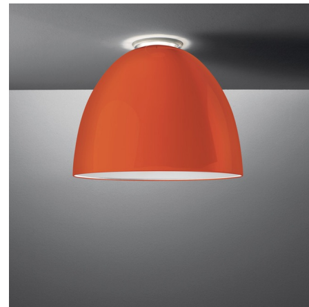
Shown in orange

COLOR N/A BODY FINISH Orange WATTAGE 150W DIMMER Standard 120V DIMENSIONS 21.69"W x 16.94"H BULB NOT INCLUDED 1 x A19/Medium (E26)/150W/120V Incandescent COUNTRY OF ORIGIN Italy