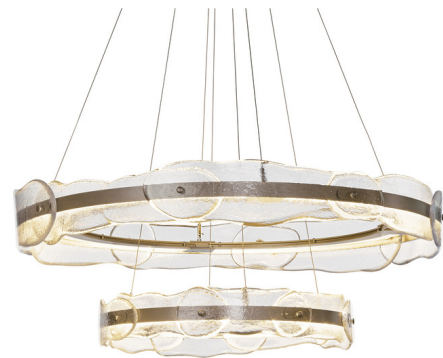
Shown in soft gold / clear

The Solstice Tiered Pendant brings an ethereal beauty to your interior space. Hand poured, textured artisanal glass creates warm glowing light against the circular steel plate. Canopy: 10.4 inch diameter. Slope ceiling adaptable to 45 degrees. Lifetime Limited Warranty when installed in residential setting. Handcrafted to order by skilled artisans in Vermont, USA.