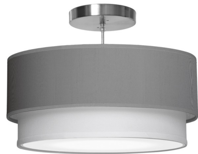
Shown in brushed nickel / silk gunmetal

PRODUCT DIMENSIONS . . . . . Cable Length: 36"