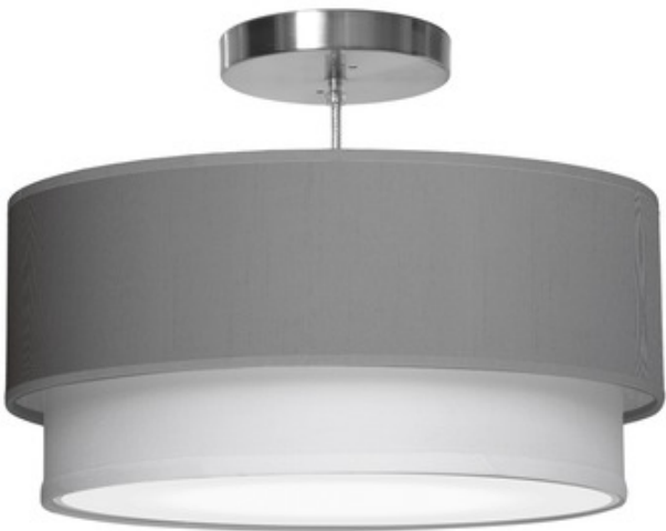
Shown in: Brushed Nickel / Silk Gunmetal

The Luther Pendant is a two tire contemporary masterpiece, making this a great addition to any exterior space. The central White drum shape shade is complemented by a gorgeous outer shade in Silk Chocolate, Silk Antique Copper, Silk Champagne, Silk Cream, Silk Ebony, Silk Orange, Silk Turquoise, Silk Verde, Silk White, Natural Veneer, Zebrawood Veneer, Photo Veneer Weather Boards, Photo Veneer Vertical Plank, Photo Veneer Teak, Photo Veneer Reclaimed, Photo Veneer Old Siding, Photo Veneer Horizontal Plank, Photo Veneer Cork, Photo Veneer Birdseye Maple, Photo Veneer Bamboo, or Walnut Stained Veneer. Finished in Brushed Nickel. Available in five sizes. Made in the USA. UL listed.