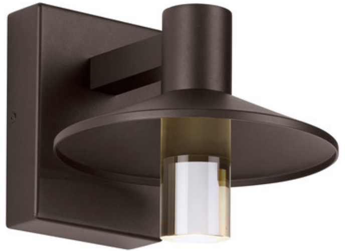
Shown in: Bronze / Clear

The Ash Outdoor Wall Sconce with Clear Cylinder is a modern take on the classic industrial style light fixture. It features a sleek metal shade and clear cylinder diffuser, ideal for spreading clean ambient light. Its die-cast aluminum construction, powder coat finish, and impact-resistant UV-stabilized clear acrylic ensure durability against harsh outdoor elements. The light is an energy-efficient integrated LED module, and a universal 120-277V driver with integrated transient 2.5 kV surge protection is included. Dimmable with an ELV or 1-10V dimmer. Four option selections are available: button photocontrol, surge protection, both the photocontrol and surge protection, or no options.