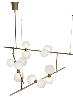
Shown in aged brass / frosted