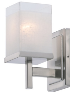
Shown in satin nickel

Tetra Wall Light has a square glass shade that rides upon a rectangular bar to create geometry at its best. Damp location rated. UL listed.