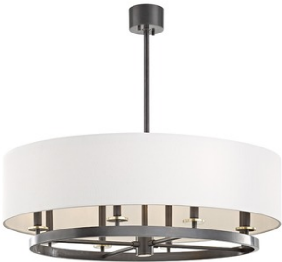
Shown in: Aged Old Bronze / Off White

The Durham Oval Chandelier offers a sophisticated look, featuring a simple metal ring bearing candle holders around and topped with one large Off-White drum shade. Available finished in Aged Brass, Aged Old Bronze, or Polished Nickel. Canopy: 4.5 inch diameter. Damp location rated. UL and CUL listed.