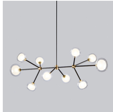
Shown in matte black / brushed brass / clear

The Nabila Linear Chandelier by TOOY draws modern design with a sputnik-like silhouette, featuring double-sided Clear borosilite glass discs extending from a Matte Black frame accented with Brushed Brass details or Smoke borosilicate glass discs extending from a Matte Black frame accented by Black Chrome details. Includes canopy to cover U.S. junction box and (1) 11.8 inch, (1) 23.6 inch, and (1) 35.4 inch downrod-- downrods can be used individually, but cannot be connected.