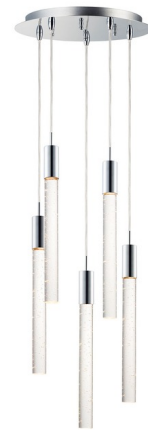
Shown in polished chrome / bubbles

PRODUCT DIMENSIONS . . . . . Min/Max Overall Height: 26.5" – 128" LAMP LIFE . . . . . 25000 hours COLOR RENDERING . . . . . 90 CRI LAMP COLOR . . . . . 3000K LUMENS/WATT . . . . . 300.00 LUMINOUS FLUX . . . . . 2400 lumens