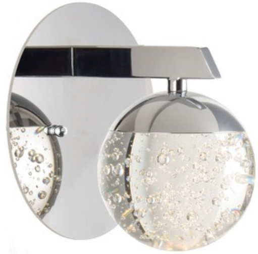
Shown in: Polished Chrome / Bubbles

The Orb II Wall Light features a sphere of Clear Bubble glass with a Polished Chrome finish. Suitable for damp locations. ETL listed.