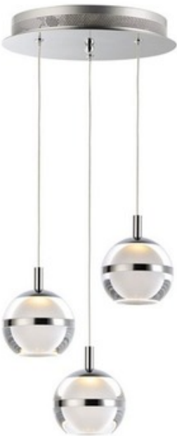
Shown in: Polished Chrome / Clear / Frosted

The Swank Multi Light Pendant features orbs of crystal Clear acrylic that are trimmed with a Polished Chrome or Natural Aged Brass band and Frosted inside for excellent light diffusion. The bottoms are dimpled for a unique optical effect. Available with three, five or eight lights. Includes 120 inches of field cuttable cords that are adjustable at of installation. Dimmable with LED compatible dimmer. ETL listed.