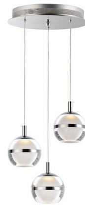
Shown in polished chrome / clear / frosted

The Swank Multi Light Pendant features orbs of crystal Clear acrylic that are trimmed with a Polished Chrome or Natural Aged Brass band and Frosted inside for excellent light diffusion. The bottoms are dimpled for a unique optical effect. Available with three, five or eight lights. Includes 120 inches of field cuttable cords that are adjustable at of installation. Dimmable with LED compatible dimmer. ETL listed.