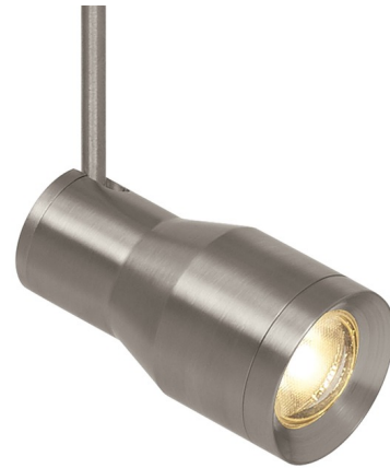
Shown in satin nickel