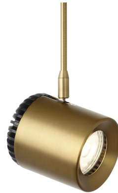
Shown in aged brass / aged brass