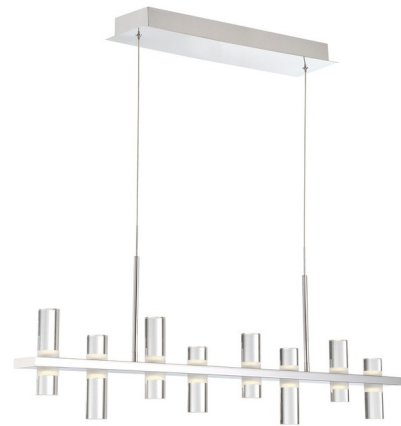
Shown in chrome / clear

COLOR RENDERING . . . . . 90 CRI LAMP COLOR . . . . . 3000K LUMENS/WATT . . . . . 80.00 LUMINOUS FLUX . . . . . 2560 lumens