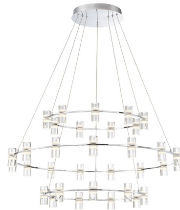
Shown in chrome / clear

COLOR RENDERING . . . . . 90 CRI LAMP COLOR . . . . . 3000K LUMENS/WATT . . . . . 2,475.00 LUMINOUS FLUX . . . . . 9900 lumens