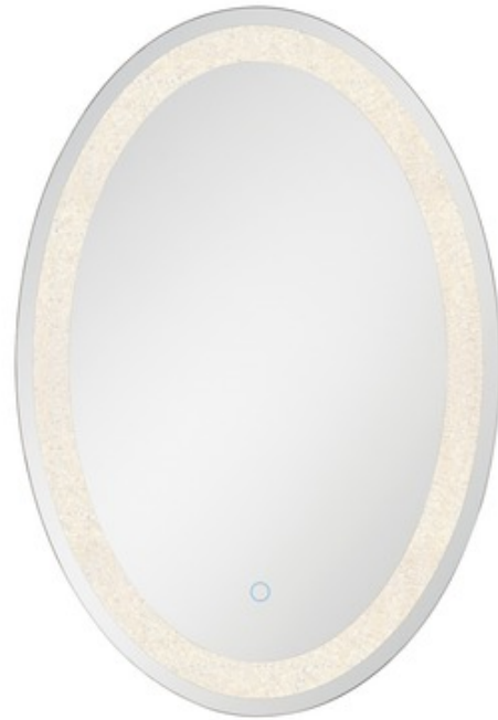
Shown in: Mirror / Crystal

The Oval Back-Lit Mirror offers a sleek, versatile design enhanced with LED technology. Features a crystal finished LED border framing the mirror with a touch sensor switch that allows you to adjust color temperature from 3000K to 4500K to 6400K to suit your lighting needs. Tunable white technology. Suitable for damp locations. UL and CUL listed. ADA compliant.