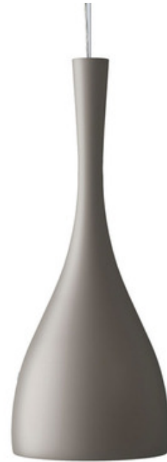
Shown in: Steel / Beige

Jazz Pendant is defined by its organic and pure form. This sleek contemporary designed pendant is finished with in Beige over a durable resin body with glass diffuser and steel canopy. ETL listed. Not dimmable.