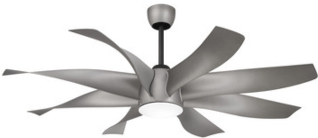
Shown in: Graphite Steel / Graphite Steel

The Dream Star Ceiling Fan with Light freshens the air with its quiet, energy-efficient DC motor while its integrated LED light delivers radiant illumination, perfect for creating a comfortable indoor environment. Its wavy ribbon-like blades offer a unique look that enhances any space. A hand-held remote control with wall holder (RC400) is included, enabling motor on/off, 6 speeds, forward and reverse, and light on/off with full range dimming. Optional accessories are sold separately.