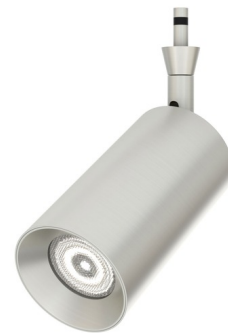
Shown in satin nickel

LAMP LIFE . . . . . 50000 hours BEAM ANGLE . . . . . 25° COLOR RENDERING . . . . . 95 CRI LAMP COLOR . . . . . 3000K LUMENS/WATT . . . . . 57.44 LUMINOUS FLUX . . . . . 517 lumens