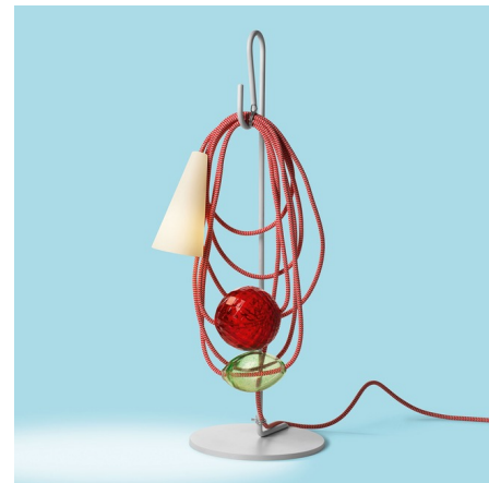
Shown in emerald king

COLOR RENDERING . . . . . 80 CRI LAMP COLOR . . . . . 3000K LUMENS/WATT . . . . . 100.00 LUMINOUS FLUX . . . . . 400 lumens