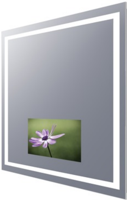
Shown in: Mirror

The Integrity Lighted Mirror with TV is designed to maximize direct illumination. Ideal for precision tasks such as makeup application and shaving. White powder coated chassis for finished side view. Corrosion-resistant OmegaMirror with Spectrum mirror glass technology. 15.6 or 21.4 inch LED HDTV with HDMI, RF and component connections. Integrated speakers for high quality stereo sound. Electric Mirror's Spectrum Mirror TVs are best suited for bathrooms that are not overly bright. When the TV is off, the screen area is camouflaged, leaving only a light gray image where the TV is located. Waterproof remote included. Note: The Integrity TV mirror must be installed in the W x H (width x height) orientation as listed; it cannot be installed in any other direction.