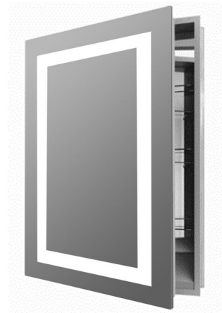
Shown in matte silver / mirror

The Ambiance Medicine Cabinet with Light features a frame of lustrous light and a precision-polished edge, an ideal match for contemporary decor. Features includes: corrosion-resistant glass, integrated defogger, mirrored interior with top light, adjustable glass shelves, interior 20 Amp 120VAC GFCI receptacle, two electrical outlets and four USB Ports. Surface mount kit included. Forward phase dimming or on/off wall switch. Note: The Ambiance mirror cabinet must be installed in the W x H (width x height) orientation as listed; it cannot be installed in any other direction.