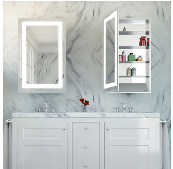
Shown in: Mirror

The Ambiance Lighted Medicine Cabinet features a frame of lustrous light and a precision-polished edge, an ideal match for contemporary decor. Features includes: corrosion-resistant glass, integrated defogger, mirrored interior with top light, adjustable glass shelves, interior 20 Amp 120VAC GFCI receptacle, two electrical outlets and four USB Ports. Surface mount kit included. Forward phase dimming or on/off wall switch. Note: The Ambiance mirror cabinet must be installed in the W x H (width x height) orientation as listed; it cannot be installed in any other direction.