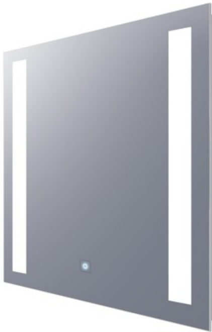
Shown in: Mirror

The Fusion Square Lighted Mirror is designed to maximize direct illumination. Ideal for precision tasks such as makeup application and shaving. White powder coated chassis for finished side view. Corrosion resistant OmegaMirror glass. Choice of standard forward phase control or with Ava dimming. Ava Smart Look technology features tunable white LED lights that allow you to select the color temperature. Select between 6500K for a day of outdoor activities, 4600K for your daily routine, or 2700K for a night out on the town. Tap to Cycle through 2700K, 4600K, 6500K, Night Glow and Off. At every level, hold to dim down to 10%. After one hour of non-use, Energy Save Mode automatically dims lights to 10%. Note: The Fusion mirror must be installed in the W x H (width x height) orientation as listed; it cannot be installed in any other direction.