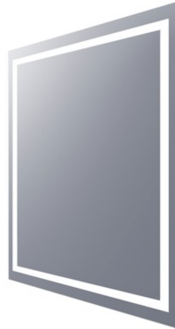
Shown in: Mirror

The Integrity Rectangle Lighted Mirror is designed to maximize direct illumination. Ideal for precision tasks such as makeup application and shaving. White powder coated chasis for finished side view. Available in eight sizes with standard or Ava control options. Standard control option allows for control with an on/off switch or forward phase dimming switch. Ava may be controlled by an external on/off light switch or with the Ava touch control located 6 inches up from the bottom of the mirror. Ava Smart Look technology features tunable white LED lights that allow you to select the color temperature. Select between 6500K for a day of outdoor activities, 4600K for your daily routine, or 2700K for a night out on the town. Tap to Cycle through 2700K, 4600K, 6500K, Night Glow and Off. At every level, hold to dim down to 10%. After one hour of non-use, Energy Save Mode automatically dims lights to 10%. Note: The Integrity mirror must be installed in the W x H (width x height) orientation as listed; it cannot be installed in any other direction.