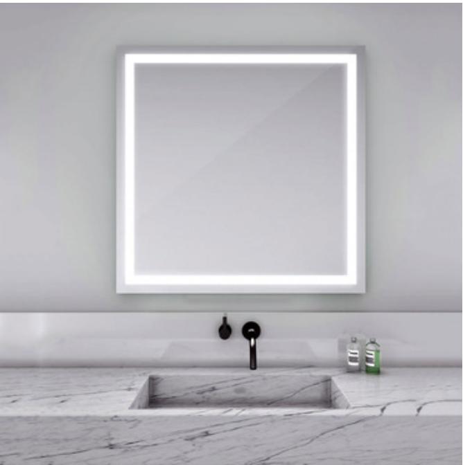
Shown in: Mirror

The Integrity Square Lighted Mirror is designed to maximize direct illumination. Ideal for precision tasks such as makeup application and shaving. White powder coated chasis for finished side view. Corrosion resistant DuraMirror glass. Available in two sizes. Choice of standard control or with AVA dimming. Ava Smart Look technology features tunable white LED lights that allow you to select the color temperature. Select between 6500K for a day of outdoor activities, 4600K for your daily routine, or 2700K for a night out on the town. Tap to Cycle through 2700K, 4600K, 6500K, Night Glow and Off. At every level, hold to dim down to 10%. After one hour of non-use, Energy Save Mode automatically dims lights to 10%. UL and cUL listed for damp locations. ADA compliant.