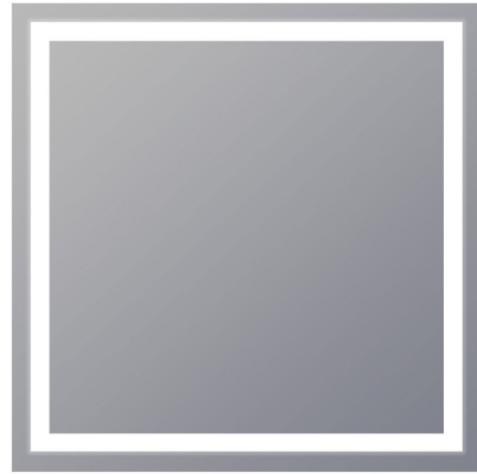
Shown in mirror

LAMP LIFE . . . . . 52000 hours COLOR RENDERING . . . . . 90 CRI LAMP COLOR . . . . . 3000K LUMENS/WATT . . . . . 130.77 LUMINOUS FLUX . . . . . 12162 lumens