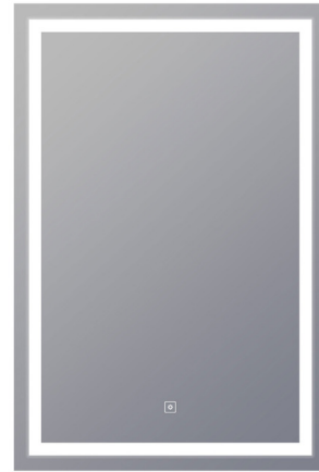
Shown in mirror

LAMP LIFE . . . . . 52000 hours COLOR RENDERING . . . . . 90 CRI LAMP COLOR . . . . . Tunable White LUMENS/WATT . . . . . 75.40 LUMINOUS FLUX . . . . . 3996 lumens