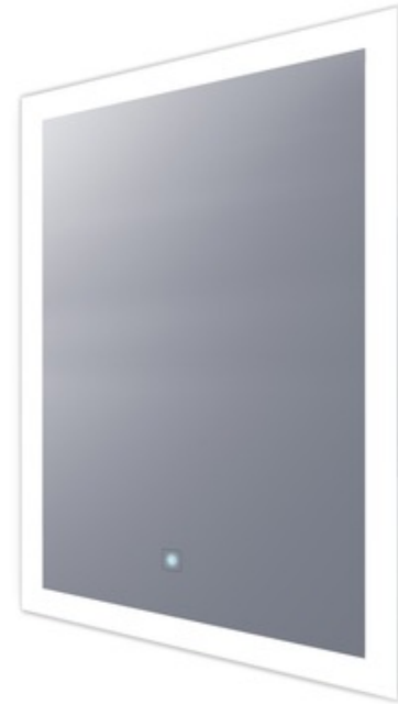
Shown in: Frosted

The Silhouette Rectangle Lighted Mirror provides a soft halo of light glowing around the perimeter of the mirror. Diffusers on the outside provide for a softer glow. Corrosion resistant OmegaMirror glass. Choice of standard forward phase control or with Keen dimming. Keen touch control features Tap-to-Cycle through On, Night Glow and Off. Hold to dim down to 10%. After one hour of non-use, Energy Save Mode automatically dims lights to 10%. Note: Silhouette can only be hung in the W x H (width x height) orientation as shown; it cannot be installed in any other direction.